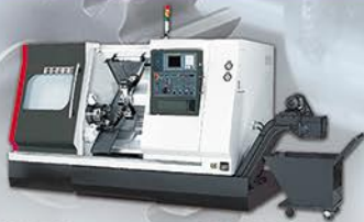
CNC MACHINES - VTL, HMC, LATHE, ETC.

Contact Us for: CNC machine Tapper alignment, Center height alignment, full reconditioning